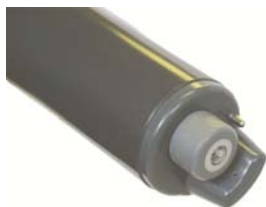
MODEL 28 pH/ORP Holder and Electrode With MODEL ST2 TRANSMITTER

The Model 28 holder connects to the Sensor Transmitter junction box (p/n ST2). The ST2 then communicates with the parent analyzer via a ZIGBEE compliant Rf module. There is an embedded antenna with an outdoor line of sight range up to one mile. When several holder/ST2 pairs are installed they form a self-healing mesh network that increases reliability.