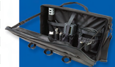
603075 soft-sided carrying case with ProODO, cable, and accessories