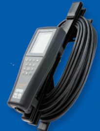
603062 cable management kit