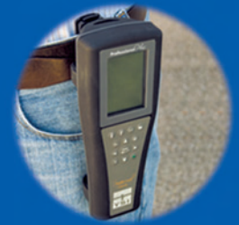
603069 belt clip