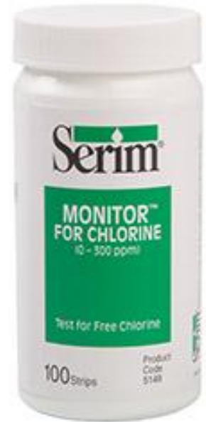
Chlorine Concentration (ppm)

Serim MONITOR for Chlorine 0-300 ppm ~ Product Code 5148 1 bottle of 100 strips