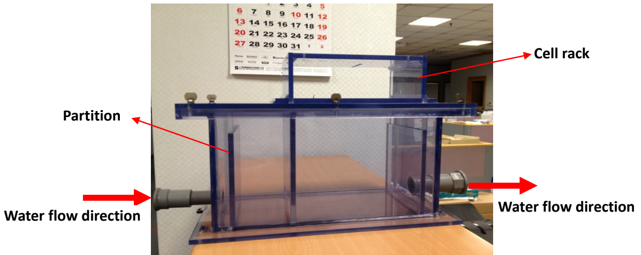
✂Flow-through chamber(Figure 1)