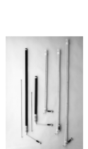
2100-STDX, 2100-LX, 2100-12, -13, -14 wands ELECTRICAL CONNECTION