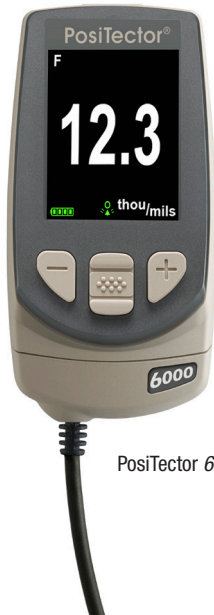
PosiTector 6000 FHXS3