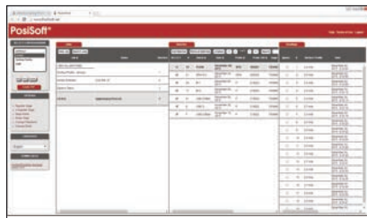
Jobs Batches Readings