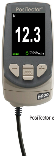
PosiTector 6000 N45S3