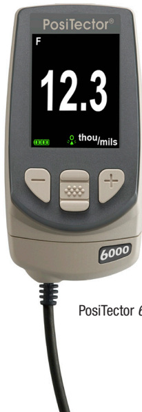
PosiTector 6000 F45S1