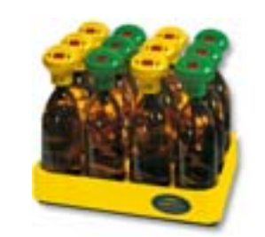
OxiTop® IS 12