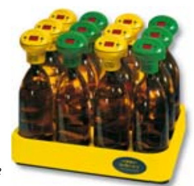
OxiTop® IS 12