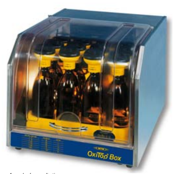
Example of an application: OxiTop® Box with OxiTop® Control 12

The box has an automatic defrosting system with condensate evaporation.