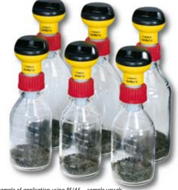
Example of application using PF/45... sample vessels

For actively respiring soils with strong CO<sub>2</sub> development the MG 1.0 measuring vessel is recommended: its large opening (approx. 3.9 in / 100 mm dia.) means that it can be easily used with large-volume CO<sub>2</sub> absorber vessels for afterwards quantitative CO<sub>2</sub> determination.