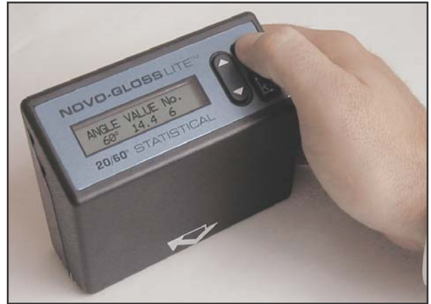
The NOVO-GLOSS LITE™ uses a simple menu-driven system operated by a user-friendly 3 button interface.