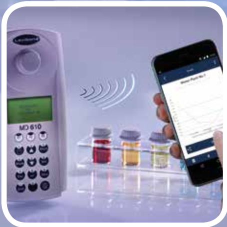
MD 600 / 610