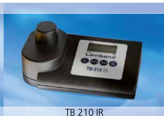
TB 210 IR