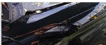
Minimized water spot