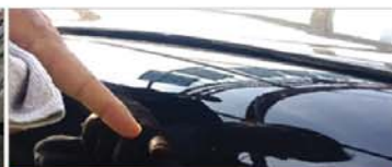
Easy to clean the surface

RustyNo MGP Glass Coating is maximized the surface tension and it makes it's own water-repellent coating on the surface. The characteristic of water-repellent is going to protect the surface from any dust and pollutants. It's own mineral blended MGP can make a minimized water spot on the surface. The MGP Glass coating is going to harder and harder if you spray MGP on surface regularly.