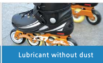
Lubricant without dust