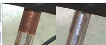
Every rust on Steel

RustyNo RC is a colorless transparent water-soluble Rust remover and it is not a in organic hazadous product . It is not contained Sulfuric Acid, Hydrochloric Acid, Nitric Acid and Phosphoric Acid. It ca be remove the rust from the surface without any harm on Base metal. User can see the reducing process in pulple color.