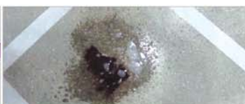
Clean the concrete surface