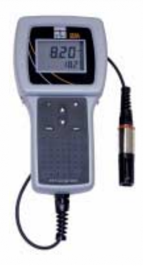
YSI 550A Dissolved Oxygen Instrument