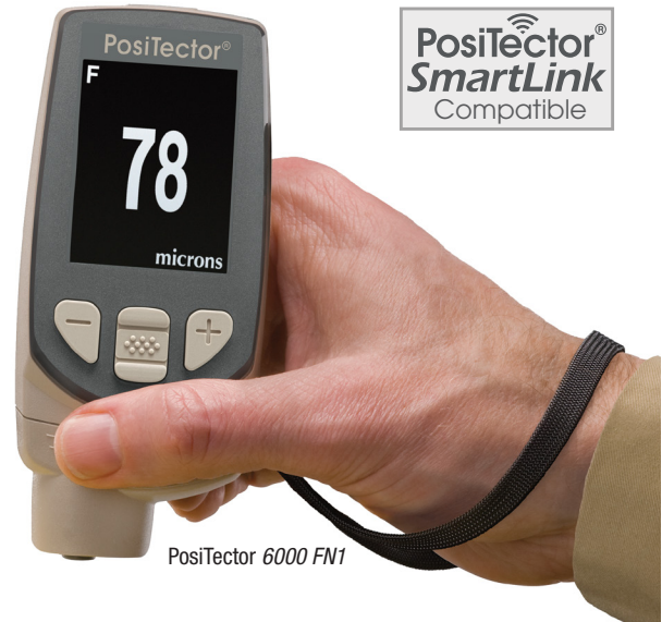
PosiTector 6000 FN1

FN probe for measuring coating thickness on ferrous and non-ferrous metal substrates. Ideal for measuring coating thickness on steel, iron, aluminum, copper and more.