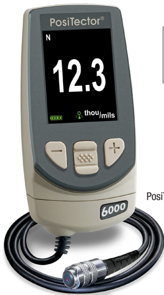
PosiTector 6000 NS1