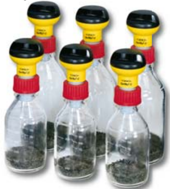
Example of application using PF/45... sample vessels

For actively respiring soils with strong CO 2 development the MG 1.0 measuring vessel is recommended: its large opening (approx. 3.9 in / 100 mm dia.) means that it can be easily used with large-volume CO 2 absorber vessels for afterwards quantitative CO 2 determination.