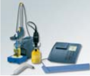
inoLab® BSB/BOD 740 with StirrOx® G