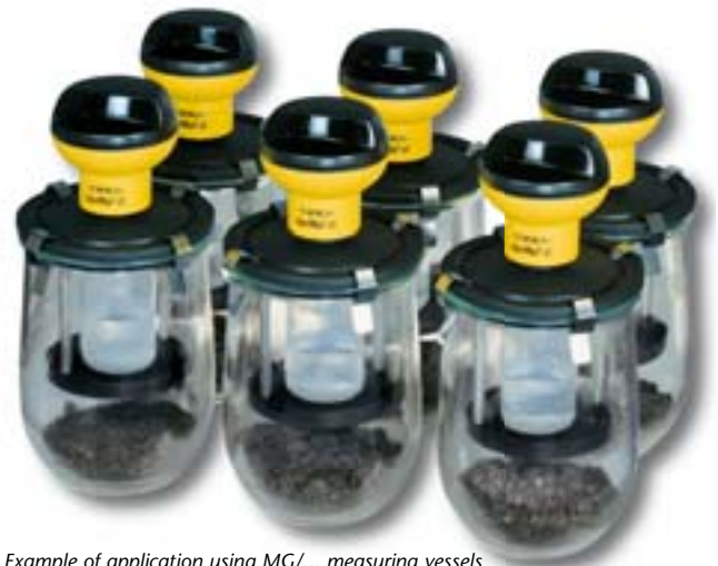
Example of application using MG/... measuring vessels