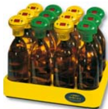
OxiTop® IS 12