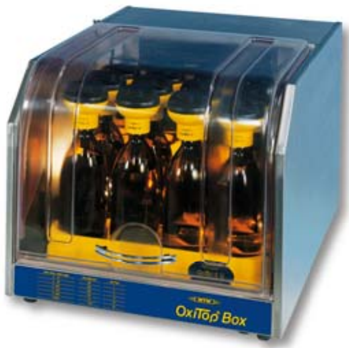
Example of an application: OxiTop® Box with OxiTop® Control 12

The box has an automatic defrosting system with condensate evaporation.