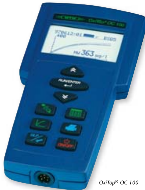
OxiTop® OC 100