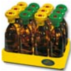
OxiTop® IS 12