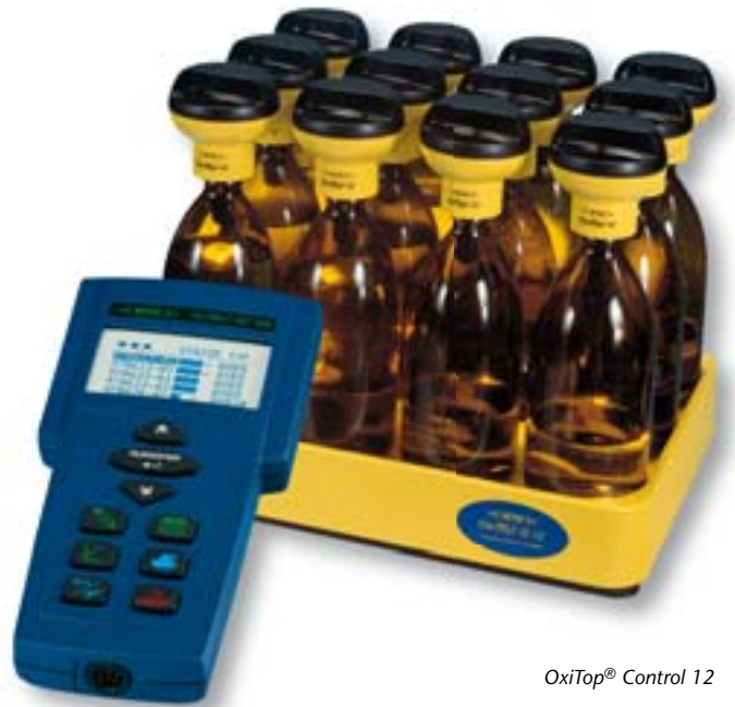
OxiTop® Control 12

Controller OC 110 in combination with the OxiTop® Control S6 / S12 is ideal for users with other applications apart from BOD (see page 74).